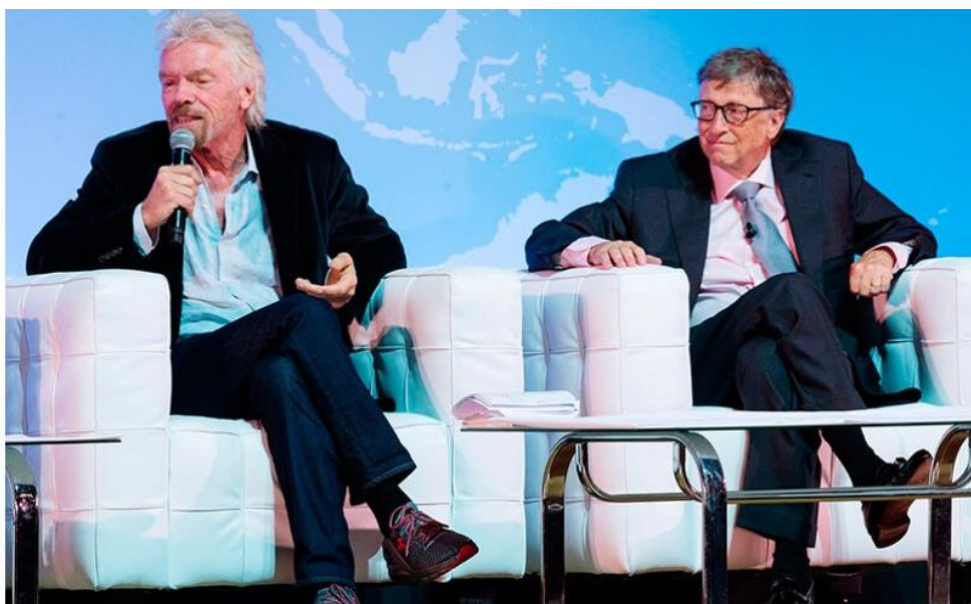
Bill Gates and Richard Branson discuss Bitcoin Evolution at CES 2019.